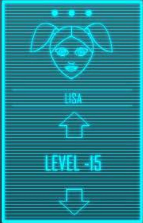
THEY REACHED AT UNDERGROUND, MINUS 15 LEVEL